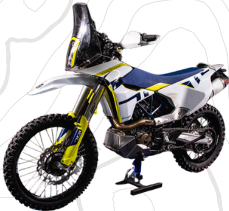
HUSQVARNA 701 ENDURO (X2)