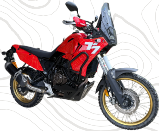
YAMAHA TENERE 700 (X4)