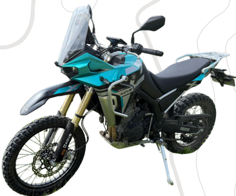
KOVE 800X RALLY