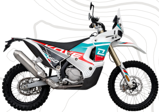
KOVE 450 RALLY